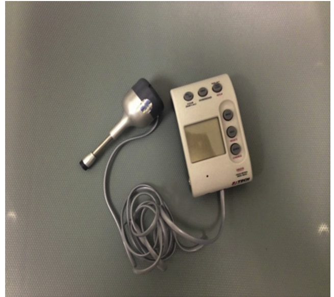
Figure 2. Algometer used for measuring pain pressure threshold (Tech Medical, Salt Lake City, UT).

Secondary outcomes included range of motion (ROM) which was determined in 3 planes of movement (flexion/extension, side bending, and rotation) using the Deluxe Cervical Range of Motion Instrument (CROM), model 12-1156 (Fabrication Enterprises, White Plains, NY). A ratio of measures of ROM over the normal range was determined for the left and right sides. The asymmetry was evaluated at baseline and at the end of treatment (3 weeks). Two additional measures of pain included a measure of pain pressure threshold (PPT) and the Brief Pain Inventory (BPI) [15]. PPT was obtained at 4 sites, following a standard procedure for assessing relative comparisons among the anatomical sites using a pressure algometer (Commander Algometer, Tech Medical, Salt Lake City, UT; http://www.jtechmedical.com/Commander/commander-algometer ) (Figure 2). Subjects were instructed to identify the moment at which symptoms underwent a qualitative shift from pressure to pain during algometer compression. The reading at that time was determined to be the PPT score. A high